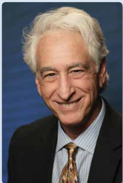
"Finding Your Voice"

If you would like to receive this newsletter but are not currently an SSF Member, please contact us! 800-475-6473